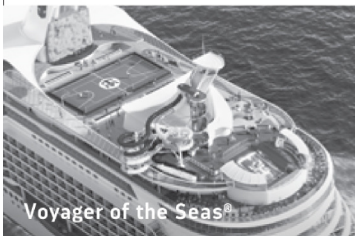
Voyager of the Seas®