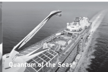
Quantum of the Seas®