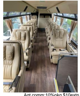
Agt comm:10%pkg $10extn