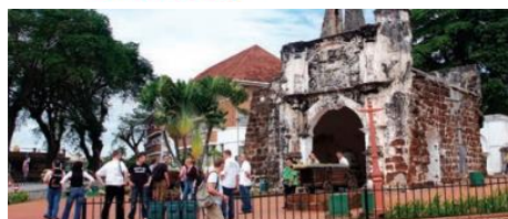
A'FAMOSA FORT (PORTA DE SANTIAGO)