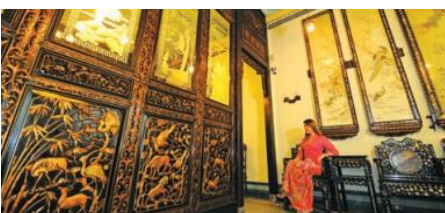
BABA & NYONYA HERITAGE MUSEUM