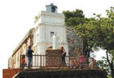
ST. PAUL'S HILL